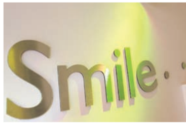
All awards and gifts can be found on the feature wall