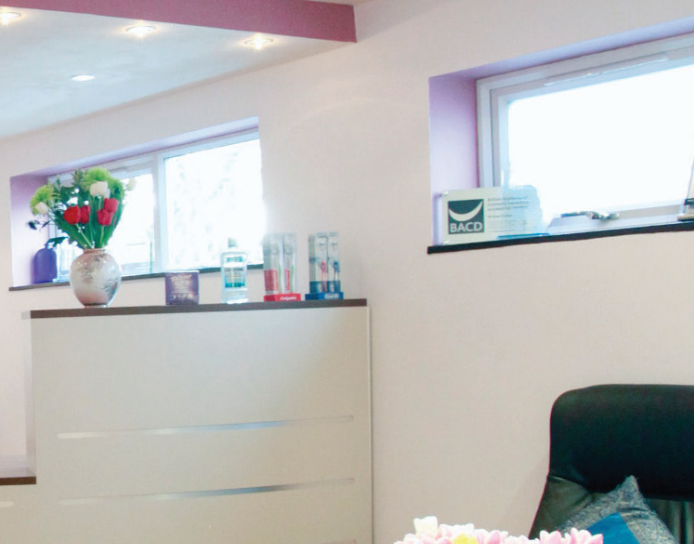
Left: the newly refurbished reception area and below, the Smile Creations team