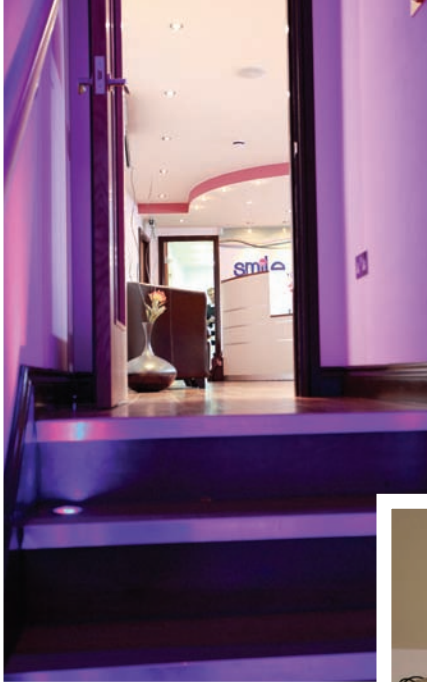
The entrance to Smile Creations, where the specialities of the practice are made clear